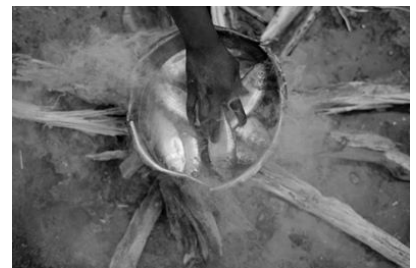
Mário Macilau (Mozambique), A Fish Story